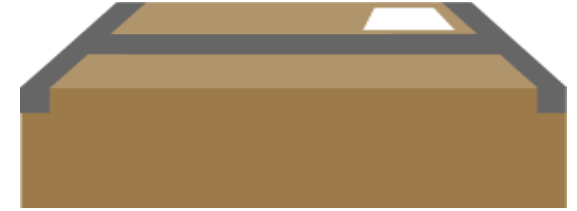
AT&T VPN Gateway 8300